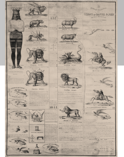
The 2520 timeprophecy is displayed on the historic 1843 and 1850 chart. Both charts were inspired and a prophetic fulfillment in itself (Hab 2:2).