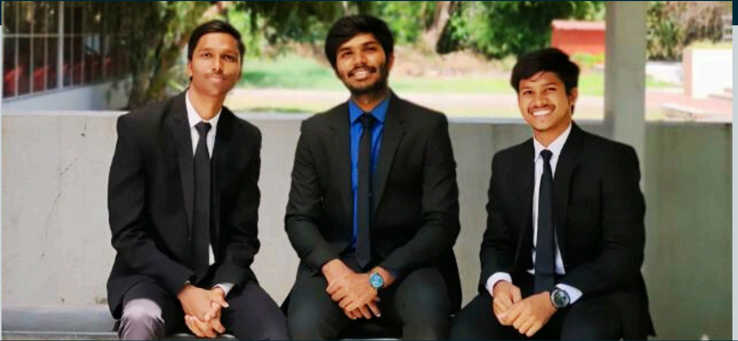
STUDENTS OF THE SPICER ADVENTIST UNIVERSITY