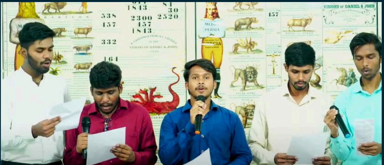
SURRENDERED THEIR LIVES TO PRESENT TRUTH